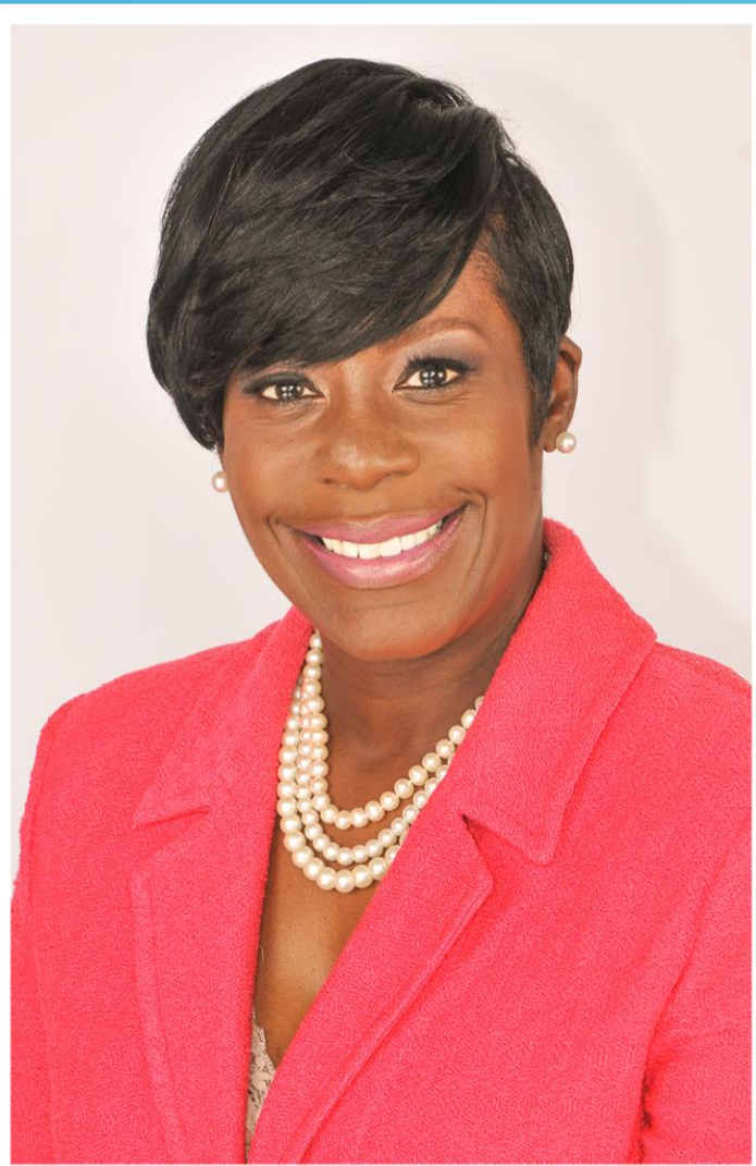
Cherelle Parker Philadelphia City Councilwoman 9 th District